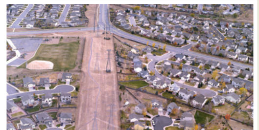
Oblique RGB and IR Solutions