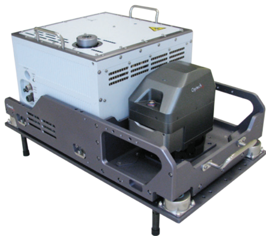
Orion C ALTM seamlessly integrated with a CS-10000 camera using an Optech sled mount