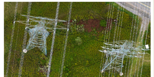
High-Resolution Digital Images