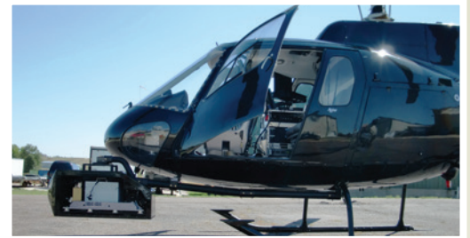
Airborne Survey Solutions